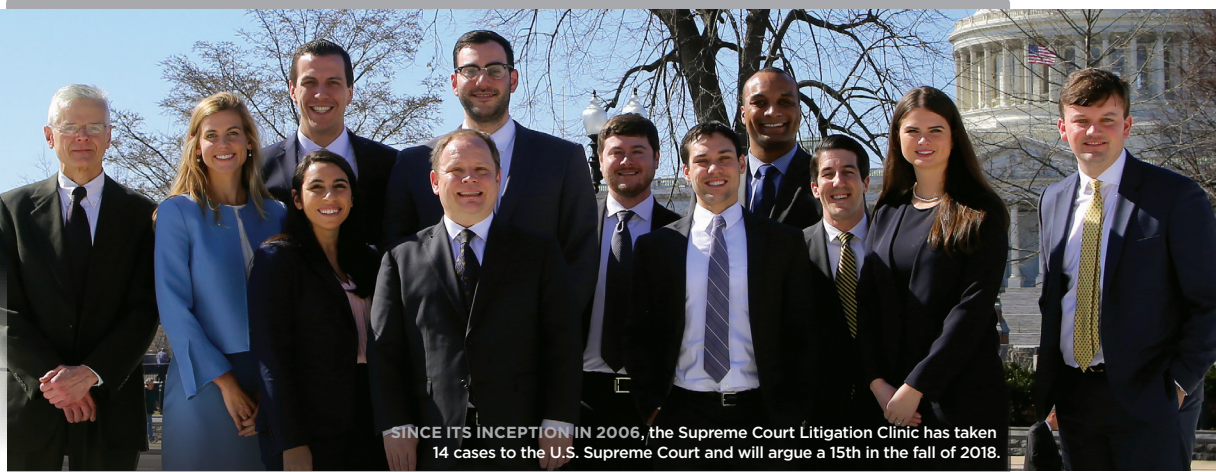
SINCE ITS INCEPTION IN 2006, the Supreme Court Litigation Clinic has taken 14 cases to the U.S. Supreme Court and will argue a 15th in the fall of 2018.

Students also advance their skills through courses in public speaking, trial advocacy and professional responsibility, as well as extracurricular moot court and mock trial competitions.