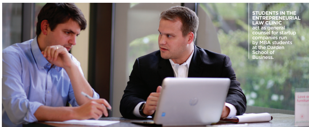
STUDENTS IN THE ENTREPRENEURIAL LAW CLINIC act as general counsel for startup companies run by MBA students at the Darden School of Business.

accomplished lawyers and judges in the country. This selective program supplements the 12 sections of trial advocacy offered each academic year.