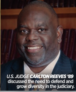
U.S. JUDGE CARLTON REEVES '89 discussed the need to defend and grow diversity in the judiciary.