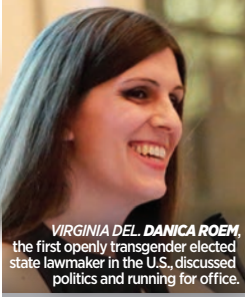
VIRGINIA DEL. DANICA ROEM , the first openly transgender elected state lawmaker in the U.S., discussed politics and running for office.

UVA SCHOOL OF LAW PROFESSORS make an impact in public policy debates.