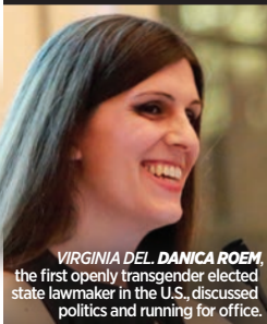
VIRGINIA DEL. DANICA ROEM , the first openly transgender elected state lawmaker in the U.S., discussed politics and running for office.

UVA SCHOOL OF LAW PROFESSORS make an impact in public policy debates.