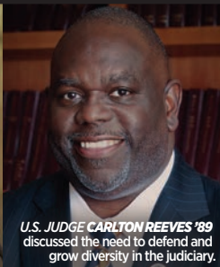
U.S. JUDGE CARLTON REEVES '89 discussed the need to defend and grow diversity in the judiciary.